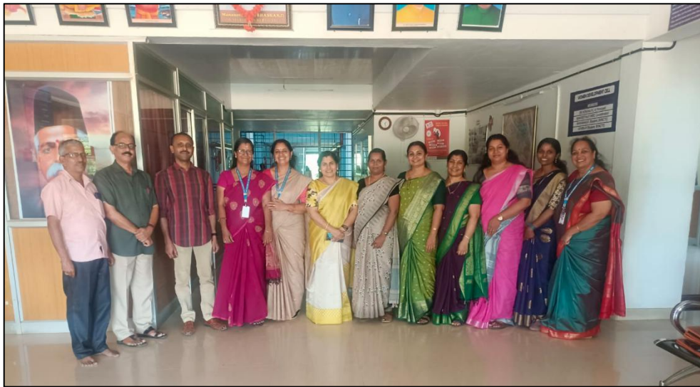
Photography 3: BVN College of Teacher Education, Kallekkad

Recognised by NCTE & Affiliated to the University of Calicut NAAC Accredited B++ Grade with 2.85 CGPA (1 st Cycle)