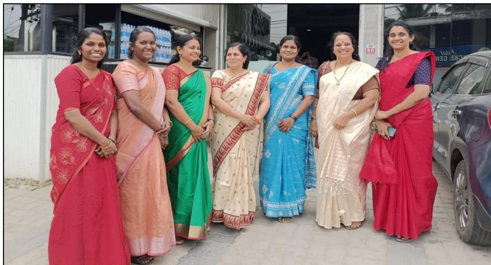
Photography 2: Sneha College of Teacher Education, Palakkad