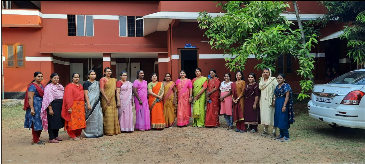
Photograph 1: Sree Vivekananda Teacher Education Center, Akkikavu, Thrissur