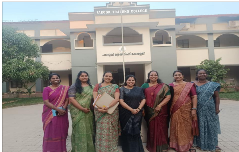
Photography 4: Farook Training College, Kozhikode