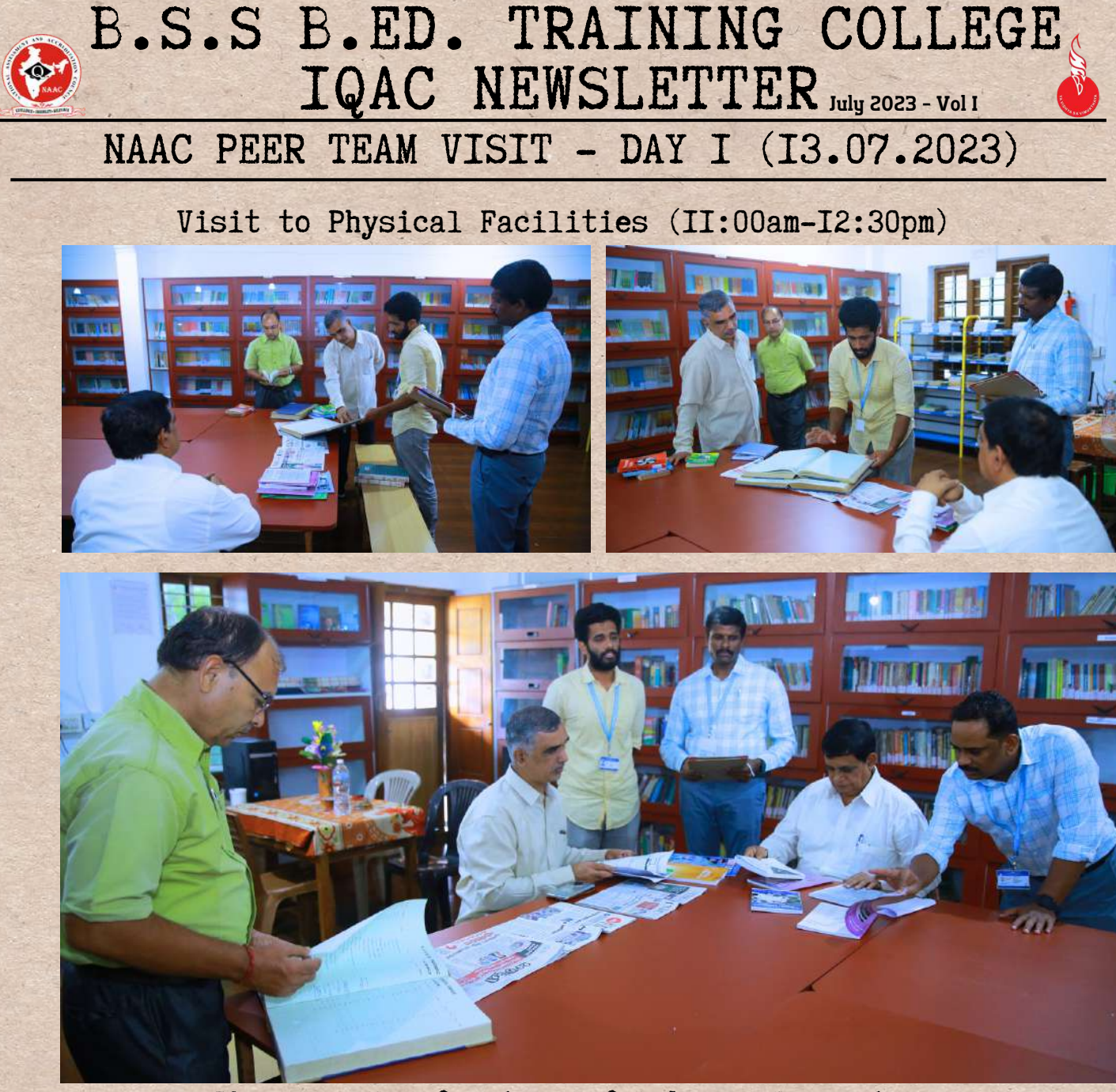
Physical Verification of Library Facilities