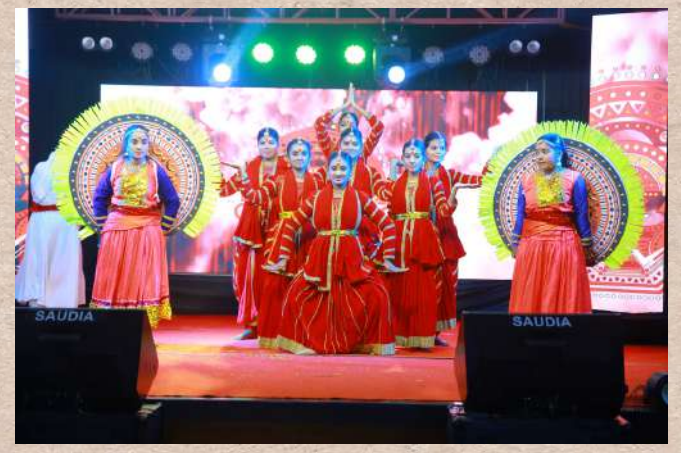
Diverse Culture of India