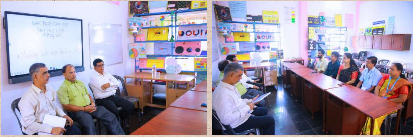
Interaction with our energetic Non-teaching staff

Interaction with Non-teaching and Teaching Staff (03:00pm-04:00pm)