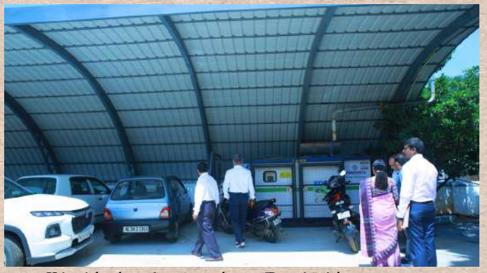
Visit to Generator Facility