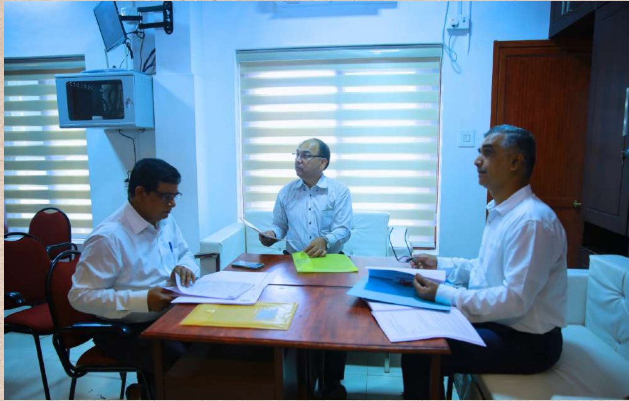
Documents Verification regarding Office Administration

Checking Documentary Evidences (II:45am-I2:30pm)