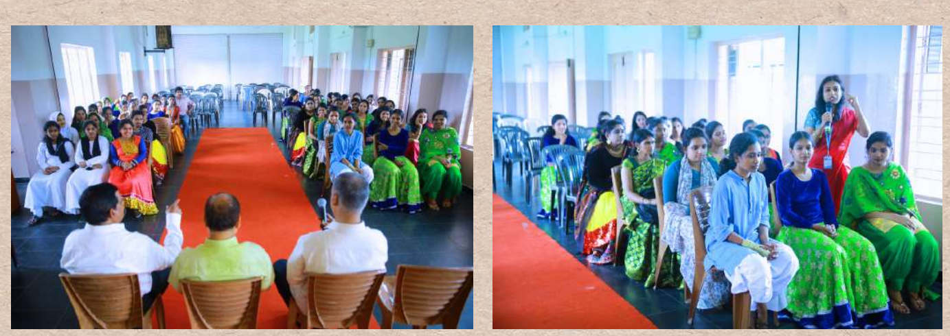
Interaction with our proud & enthusiastic student-teachers

Interaction with our prestigious Alumni Association Members