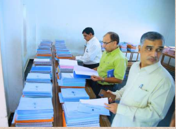
Physical Verification of Records Room