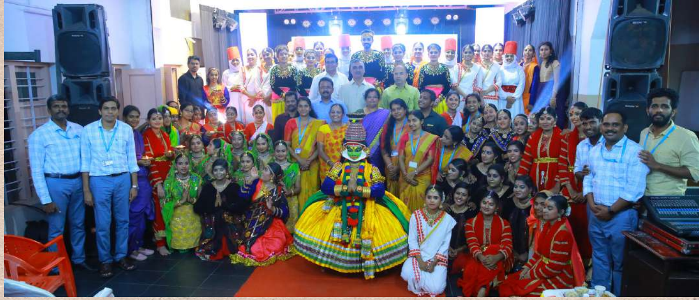
Grandeur movement of our Cultural Events

Cultural Programme by Student-teachers (05:30pm-06:30pm)