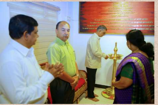
On the auspicious occasion, Lighting of Lamp by the dignitaries with Prayers.

ESS B.Ed. Training College teaching staff, non-teaching staff and perspective teachers welcoming our NAAC Peer Team Visiting Members by showing the traditional and cultural practices.