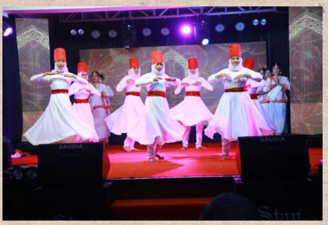
Diverse Culture of India