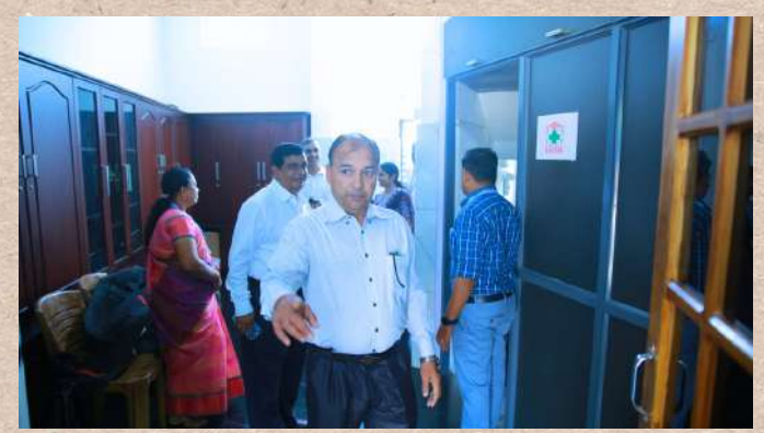
Visit to Common Room Facilities

Visit to Rest Room & Wash Room Facilities