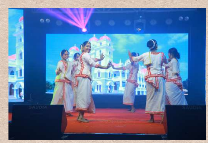
Diverse Culture of India