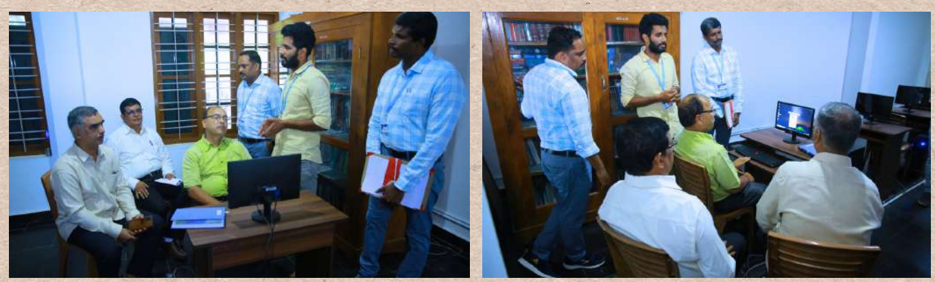
Physical Verification of Digital Reading cum Reference Centre