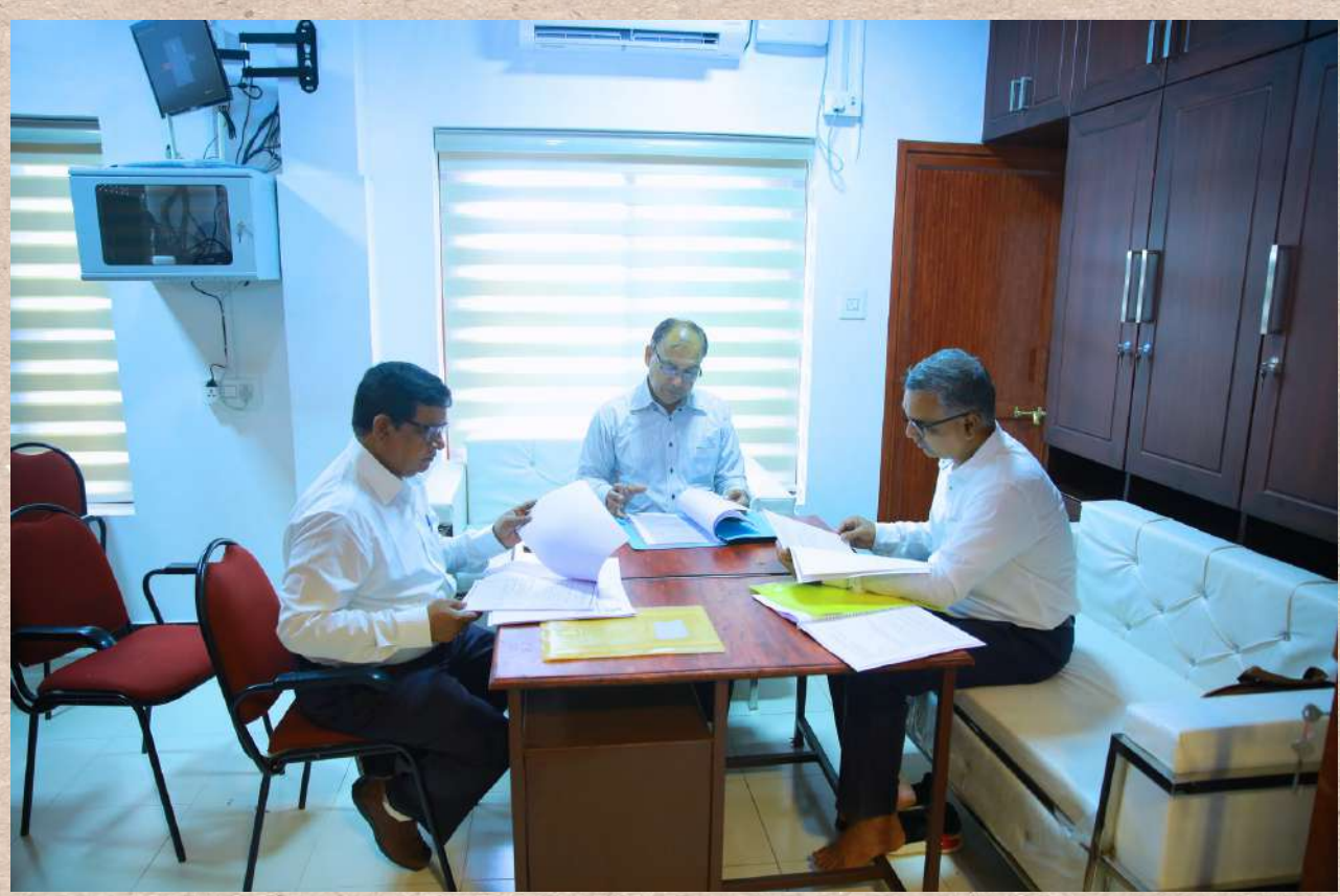
Documents Verification regarding Office Administration