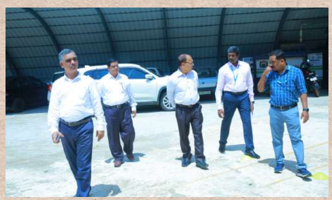
Visit to Four Wheeler Parking Facility