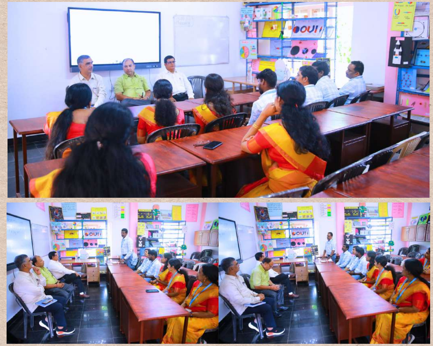
Interaction with our Learned Professors (Teaching Staff)