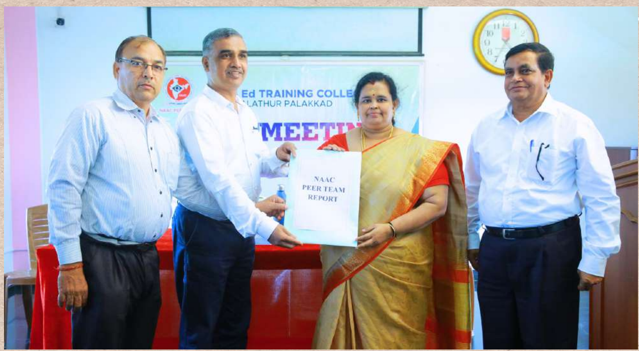
NAAC Peer Team Report submitted to the Principal by the Chairman of the NAAC Peer Team Visiting Committee